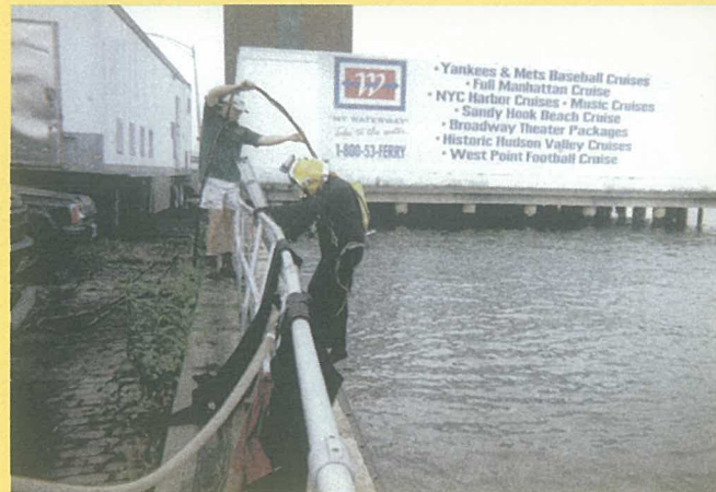
Diver entering the Hudson at Pier 81

construction work. This task falls to the divers who inspect the bulkhead and marine structures. The inspection is a slow process because there is little visibility under the water. The divers can only see approximately six inches in front of them. They rely on the light attached to their 25 pound helmets and their sense of touch. The divers relay their findings via radio to a team member on the