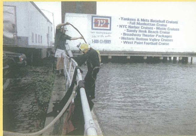
Diver entering the Hudson at Pier 81

construction work. This task falls to the divers who inspect the bulkhead and marine structures. The inspection is a slow process because there is little visibility under the water. The divers can only see approximately six inches in front of them. They rely on the light attached to their 25 pound helmets and their sense of touch. The divers relay their findings via radio to a team member on the