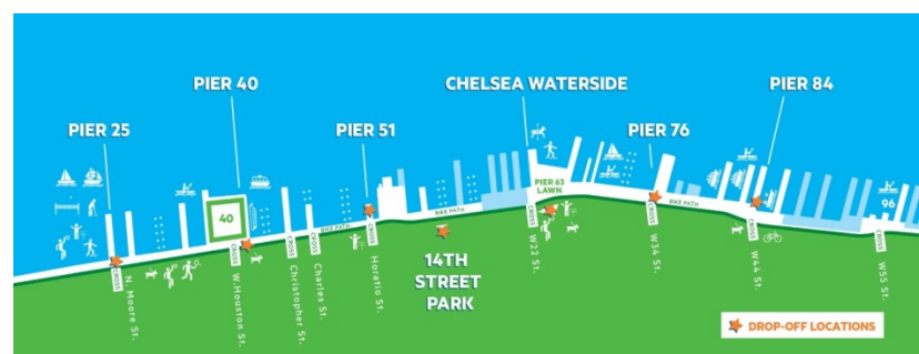
Fig. 1 (above) | Map of the compost drop-off locations throughout Hudson River Park.