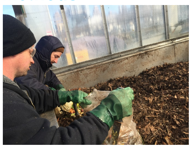
Fig. 2 (left) | Organic waste is collected at HRPK's compost center and processed in an aerating vessel in order to produce compost.