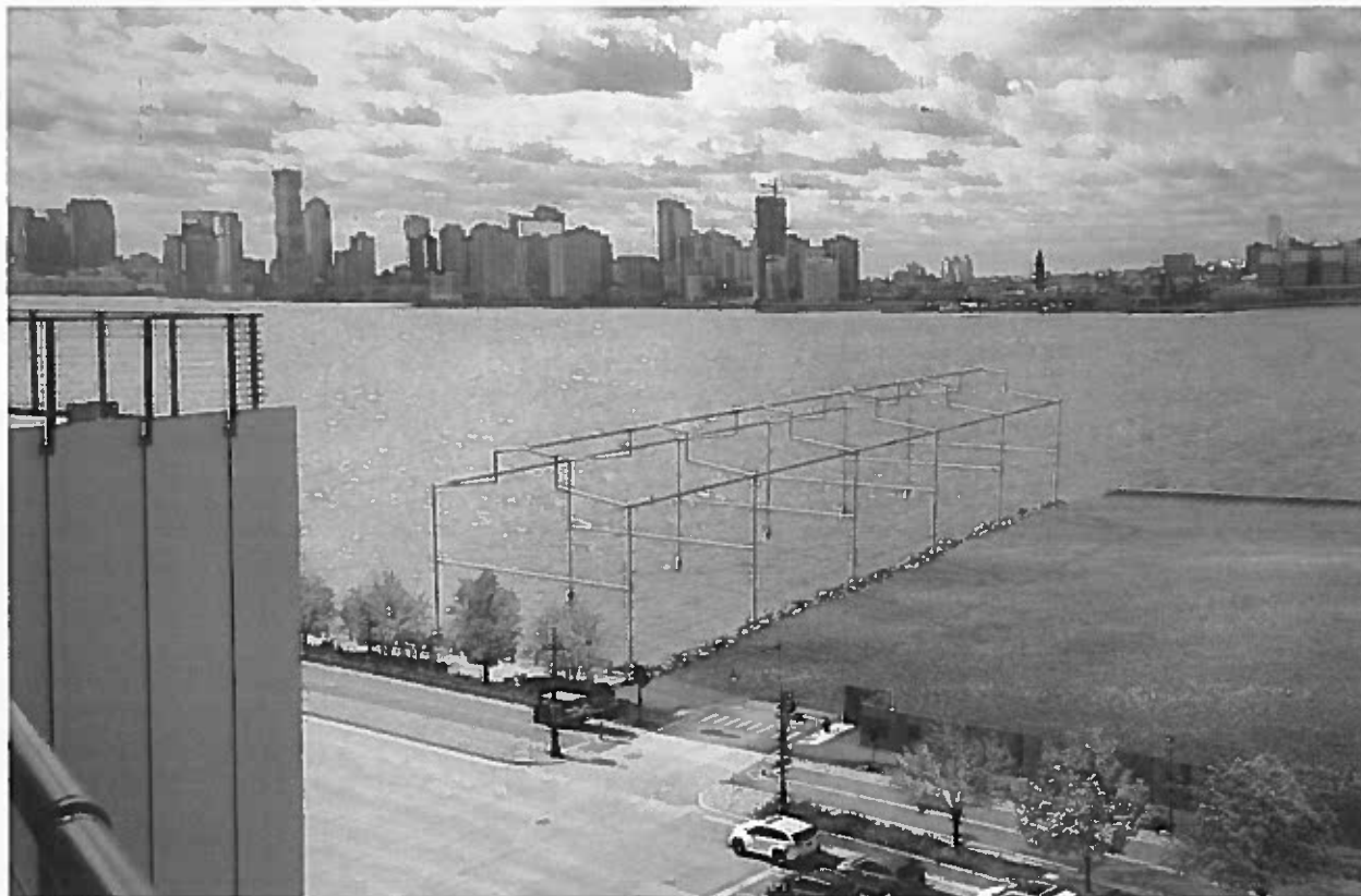
EXHIBIT B PROPOSED SCULPTURE