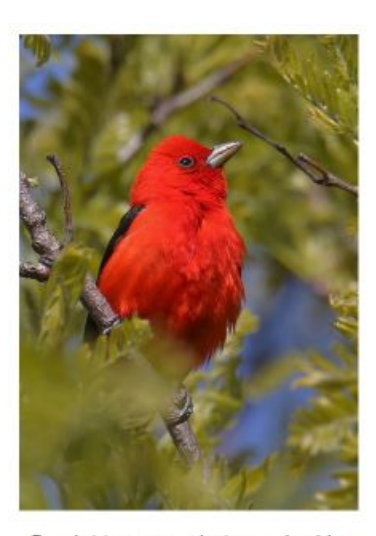
Scarlet tanager

6. Name your bird. Many birds are named for the parts of their body that set them apart from other species, like the yellow-bellied sapsucker or the scarlet tanager. What parts of your bird make it unique?